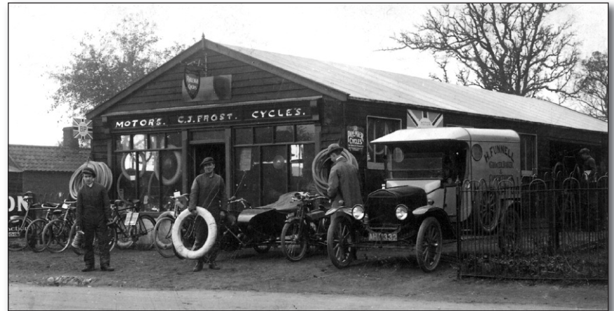
The garage of C J Frost dealt with the sale and repair of cycles, motorcycles and sometimes cars in the village of Mulbarton, south of Norwich.