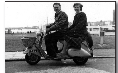
This couple on their Vespa scooter seem to epitomise the height of respectability. Their very English style of clothing contrasts somewhat with what the Mods might be wearing on their forays down to Brighton a few years later.